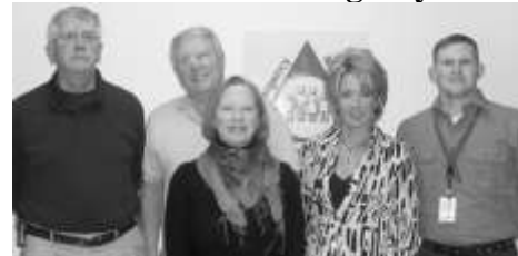
OEM Staff from Left to Right