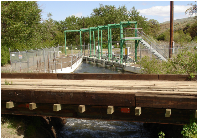
Upper WIP Diversion Ahtanum Creek