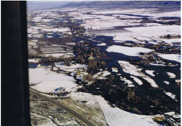
The Community of Ahtanum Looking East