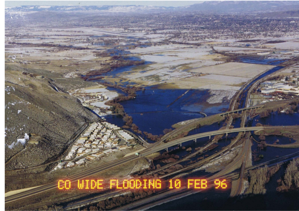
Confluence of Ahtanum Creek, Wide Hollow Creek & Yakima River - Looking Northwest