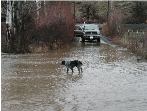
Driveway off of Ahtanum Road Looking North