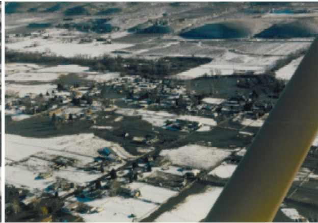
42 nd Avenue & Emma Lane Area Looking Southeast