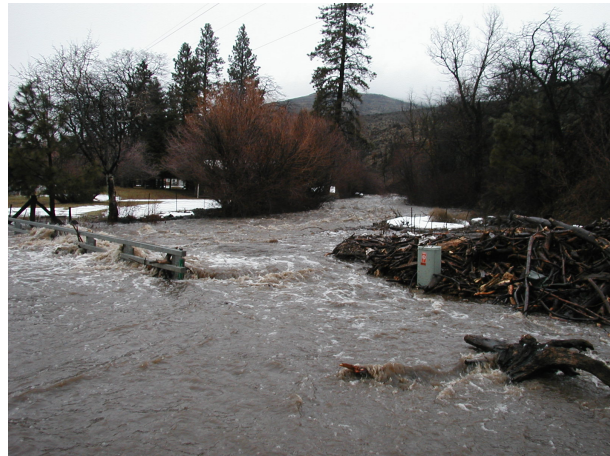
North Fork Ahtanum Creek Looking Northwest