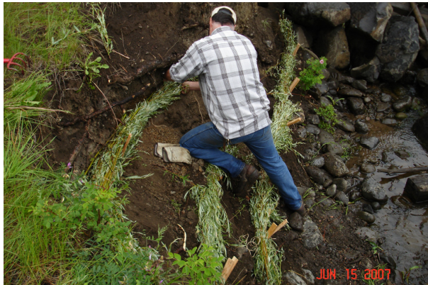
Staking the fascines