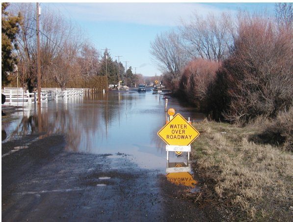
42 nd Avenue & Ahtanum Creek Looking North