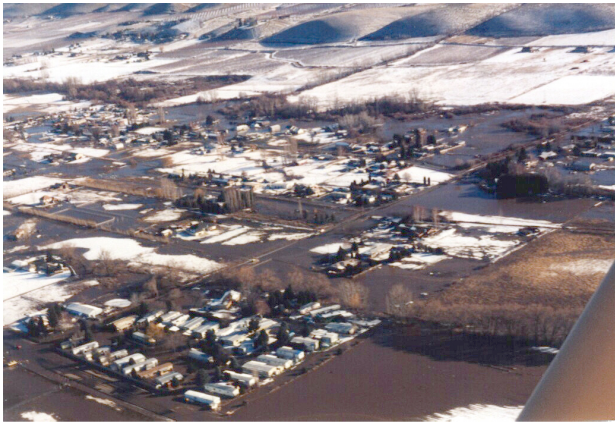
42 nd Avenue & Emma Lane Area Looking Southeast