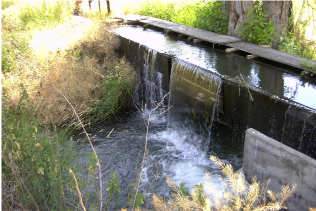
YVCC Crossing Wide Hollow Creek & 101 st Ave