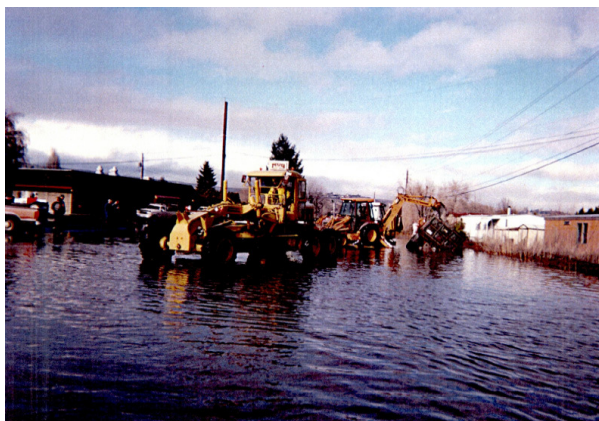
80 th Avenue & Wide Hollow Road Looking North