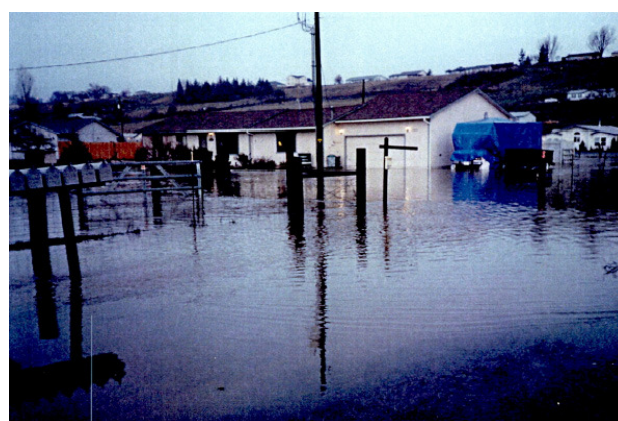
Wide Hollow Road near 84 th Avenue Looking Northwest