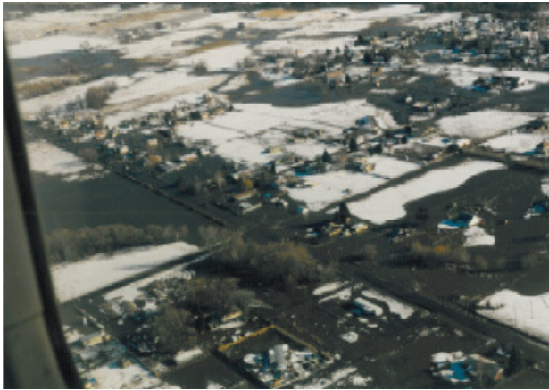
42 nd Avenue & Emma Lane Area Looking Southeast