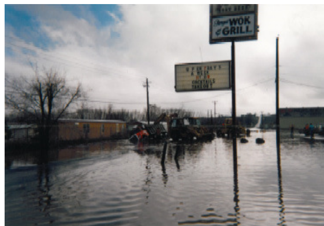
80 th Avenue & Wide Hollow Road Looking South