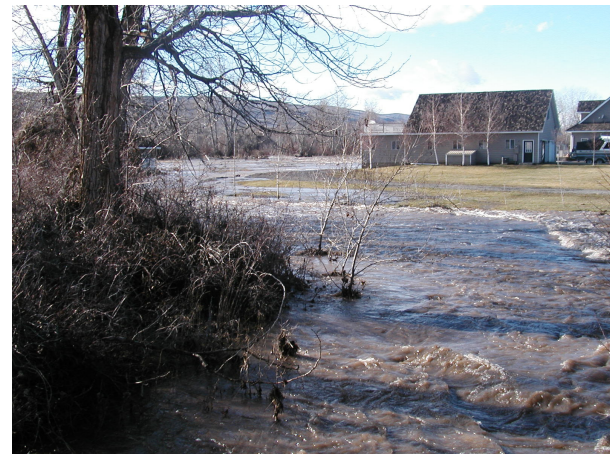
American Fruit Road & Ahtanum Creek Looking West