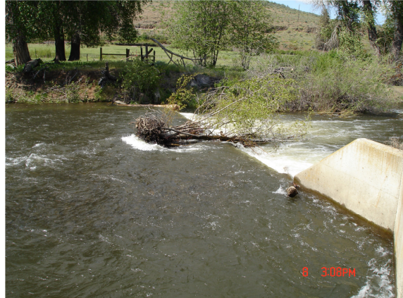
Old Hatton Diversion Ahtanum Creek