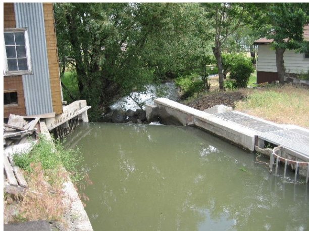
City of Union Gap – Looking East