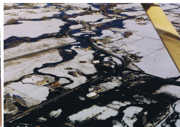
Rutherford Road & American Fruit Road Looking Northeast