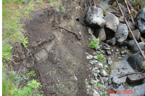
Area to be stabilized

A fascine is a rough bundle of brushwood used for strengthening an earthen structure, or making a path across uneven or wet terrain. Typical uses are protecting the banks of streams from erosion, covering marshy ground and so on.