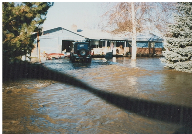
Emma Lane– Looking North