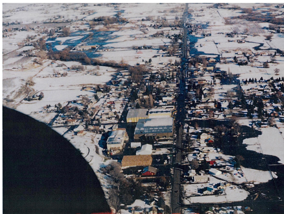
Community of Ahtanum Looking East