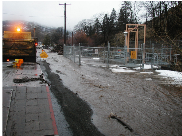
John Cox Diversion Ahtanum Creek