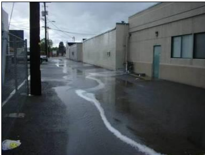
Figure 1. Stormwater runoff from a building roof.

Pollutants carried into the storm drain system by stormwater eventually are discharged to surface water or groundwater. These pollutants may adversely impact receiving water quality and threaten aquatic life, wildlife, and human health (Table 1).