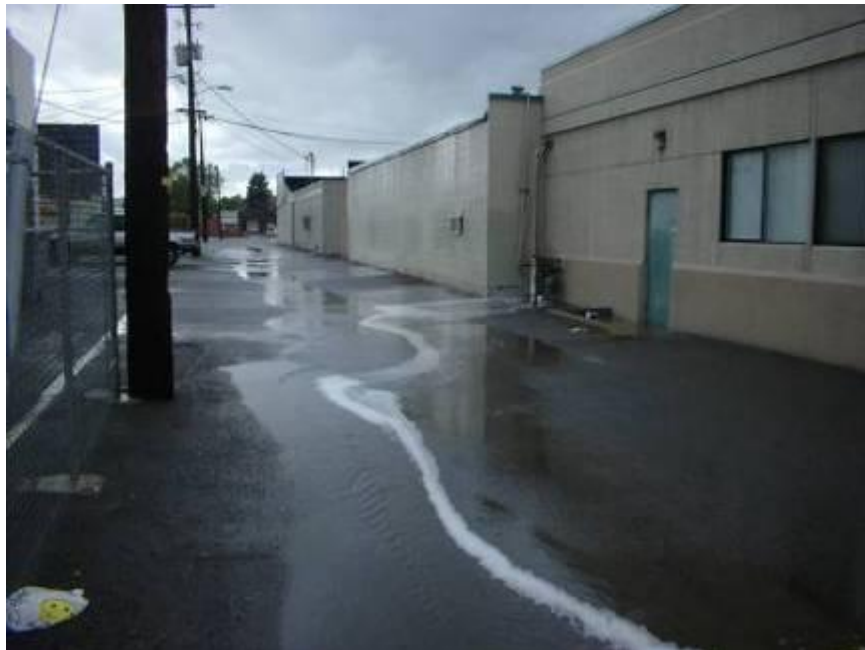
Figure 1. Stormwater runoff from a building roof.

Pollutants carried into the storm drain system by stormwater eventually are discharged to surface or ground waters. These pollutants may adversely impact receiving water quality and threaten aquatic life, wildlife, and human health (Table 1).