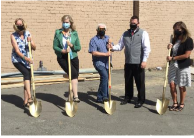
City and County elected officials break ground on the new site (Summer 2020)