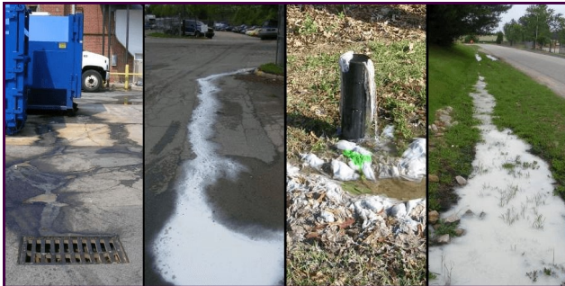
Examples of Illicit Discharges

To report a suspected illicit discharge in the Cities of Selah, Sunnyside, Union Gap, or the County, call (509) 574-2300; or email